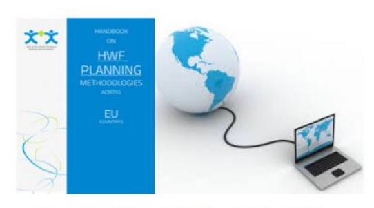
First web-handbook on planning methodologies across EU Countries